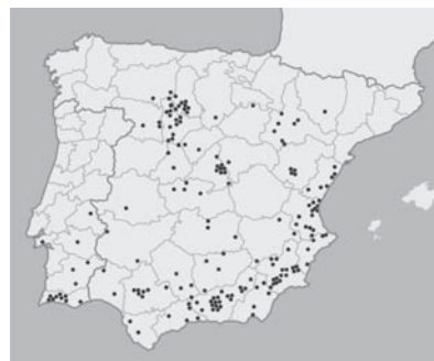
Figure 1. Location of the buildings catalogued up to date and introduced in the data base.

On the other hand, using the database previously created, a first selection of interesting cases was drawn up, which may increase in the future depending on the interest that may be aroused by the new cases introduced in the database. The selection of the first approximately 50 cases was based on: the interest of the building, the interest and importance of the restoration works, the variety of building techniques used, the presence of different interventions carried out at different times, etc. For the buildings selected, a detailed file was drawn up to contain the information necessary to analyse the intervention criteria and techniques and the results of these. The files were drawn up by the architects,